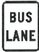
Bus lane sign (rule 154)