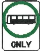
Bus only lane sign (rule 154A)