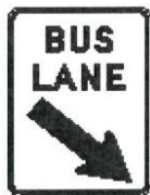
Bus lane sign (rule 154)