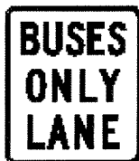
Bus only lane sign (rule 154A)