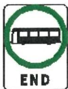
End bus only lane sign (rule 154A)