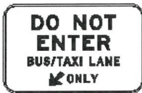
Bus lane sign (rule 154)