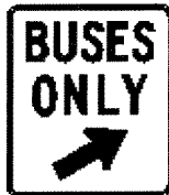
Bus only lane sign (rule 154A)

(b) by inserting the following traffic signs after the 16th traffic sign: