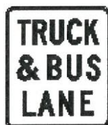
Bus lane sign (rule 154)